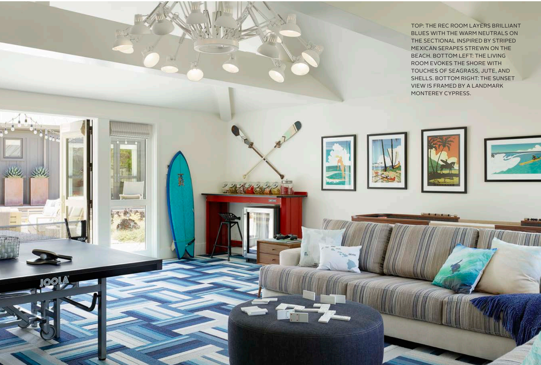
TOP: THE REC ROOM LAYERS BRILLIANT BLUES WITH THE WARM NEUTRALS ON THE SECTIONAL INSPIRED BY STRIPED MEXICAN SERAPES STREWN ON THE BEACH. BOTTOM LEFT: THE LIVING ROOM EVOKES THE SHORE WITH TOUCHES OF SEAGRASS, JUTE, AND SHELLS. BOTTOM RIGHT: THE SUNSET VIEW IS FRAMED BY A LANDMARK MONTEREY CYPRESS.