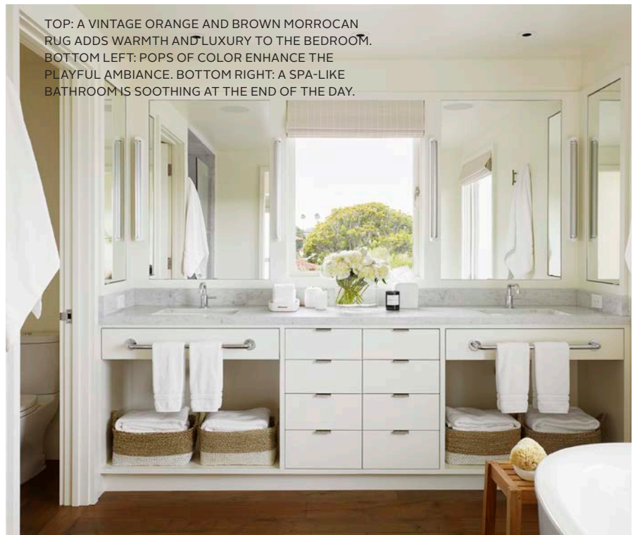
TOP: A VINTAGE ORANGE AND BROWN MORROCAN RUG ADDS WARMTH AND LUXURY TO THE BEDROOM. BOTTOM LEFT: POPS OF COLOR ENHANCE THE PLAYFUL AMBIANCE. BOTTOM RIGHT: A SPA-LIKE BATHROOM IS SOOTHING AT THE END OF THE DAY.