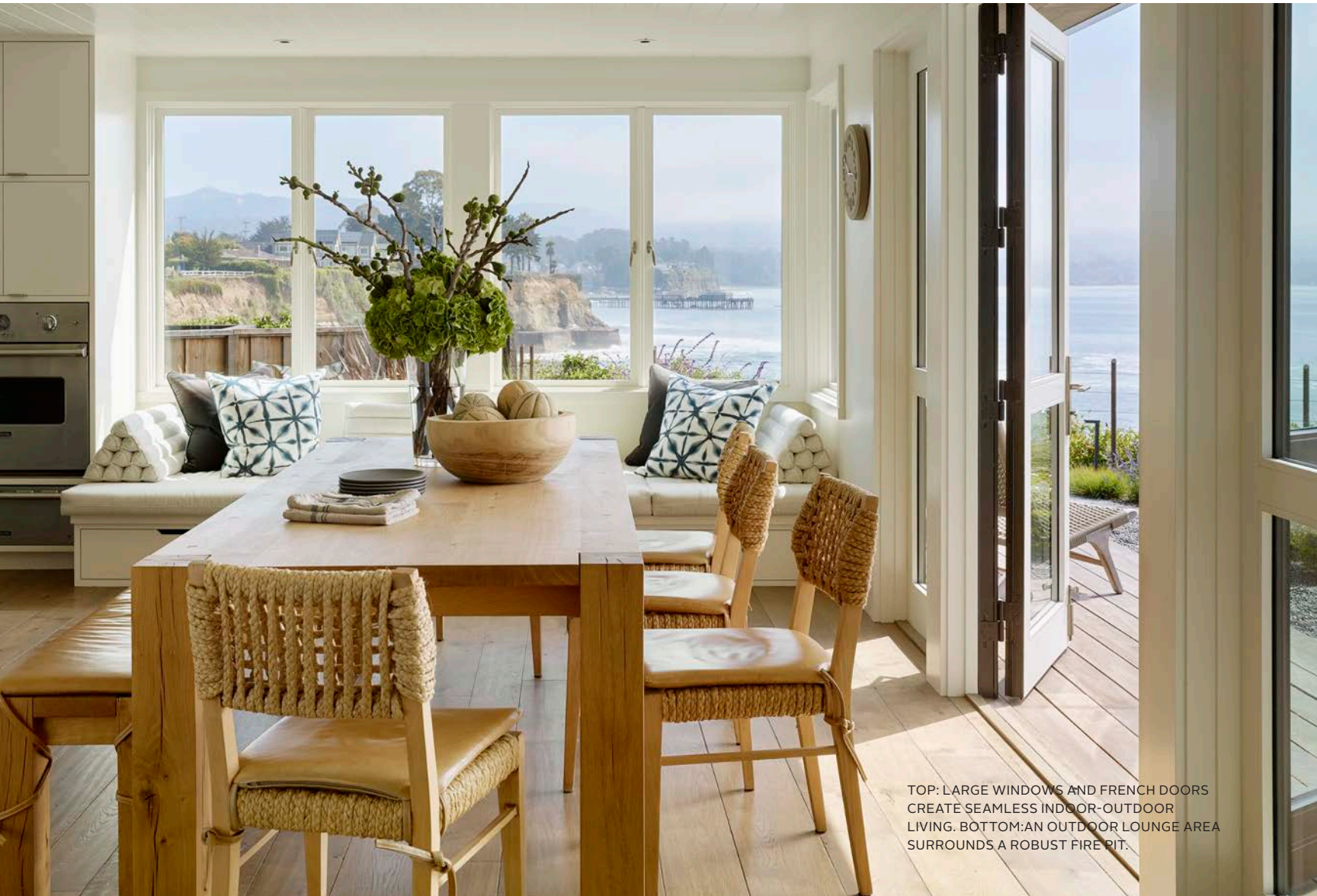
TOP: LARGE WINDOWS AND FRENCH DOORS CREATE SEAMLESS INDOOR-OUTDOOR LIVING. BOTTOM: AN OUTDOOR LOUNGE AREA SURROUNDS A ROBUST FIRE PIT.